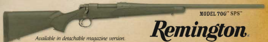
MODEL 700™ SPS™

Available in detachable magazine version.