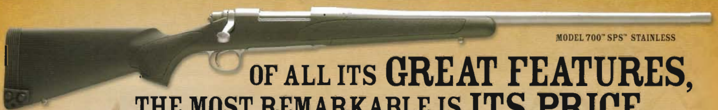
MODEL 700™ SPS™ STAINLESS

OF ALL ITS GREAT FEATURES, THE MOST REMARKABLE IS ITS PRICE.